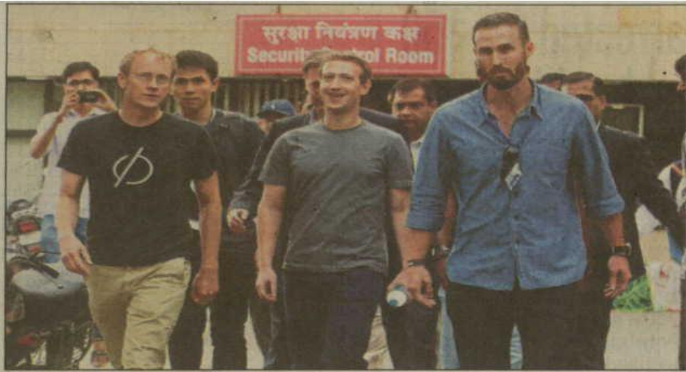
■ Facebook chairman and CEO Mark Zuckerberg (C) at IIT Delhi.